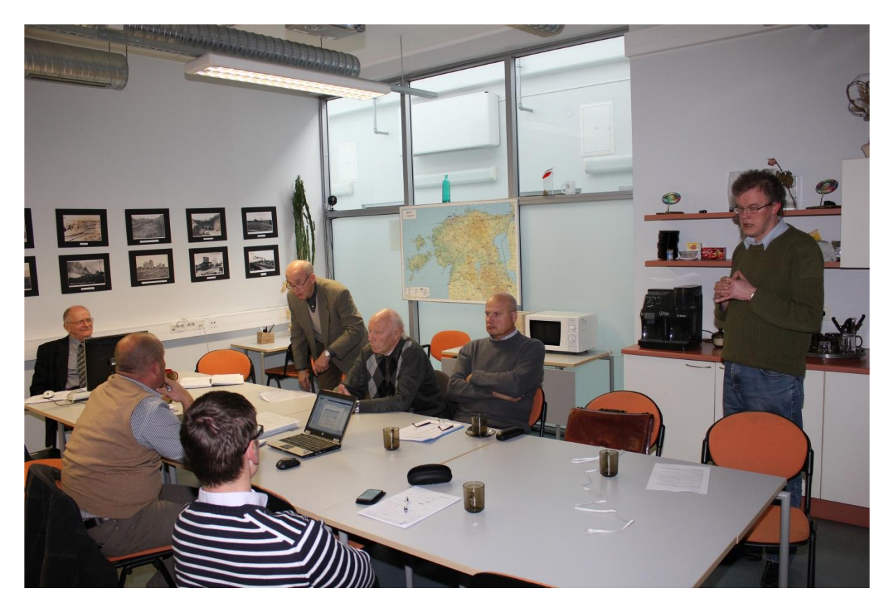
Figure 1 One of the regular meetings of Estonian Mining Society for discussions of professional standards in the Depatrment of Mining of TUT

The main activities in seismic monitoring and analyses include cross country seismic analyses for large seismic events as blasting in oil shale open casts, limestone and dolostone quarries, construction blasting and military events. Small scale seismic monitoring and analysing is done in small scale blasting in quarries, construction, military and underground mining application. The main problem related to underground blasting in oil shale mines is related to the fracturing of support pillars, weakening of immediate roof layers causing danger of roof collapsing, pillar collapsing, mine section collapsing and land subsidence. Large scale blasting needs mainly optimisation analyses for even fragmentation of rocks, low seismic, dust and noise affect.